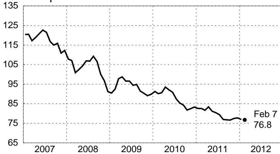
Yen per Dollar